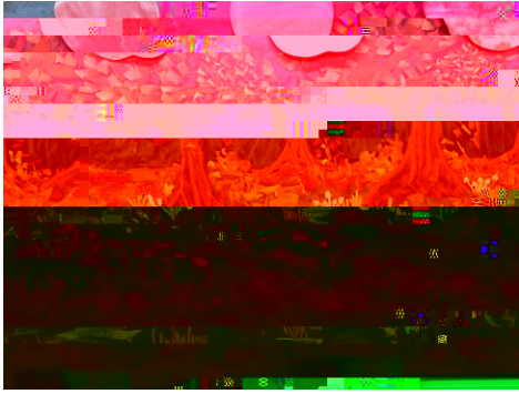
Hybrid Chalkboard Drawing