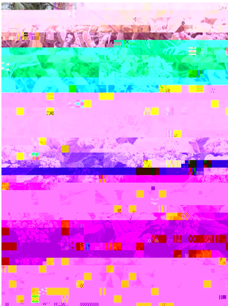
Fall on the playground